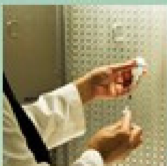
Advanced IV Therapy