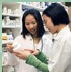
Trusted Customer Service