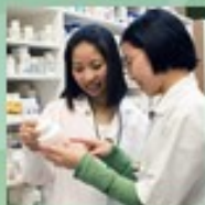
Trusted Customer Service