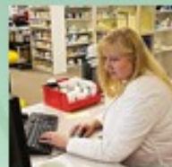
Customized eMAR Integration