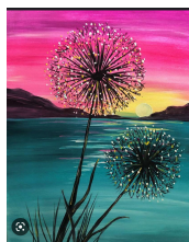
Pre-selected art - Dandelion

Cancellations must be received on/before May 29th for a Full Refund. If received after May 29th, refund available less $75.00 cancellation fee. If received after June 4th, refund available less $400. cancellation fee to cover ordered meals/materials. Replacements Welcome; No Show-No Refund