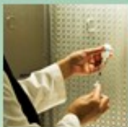
Advanced IV Therapy